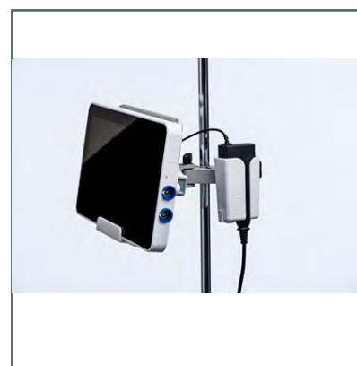
aView 2 Advance on IV pole